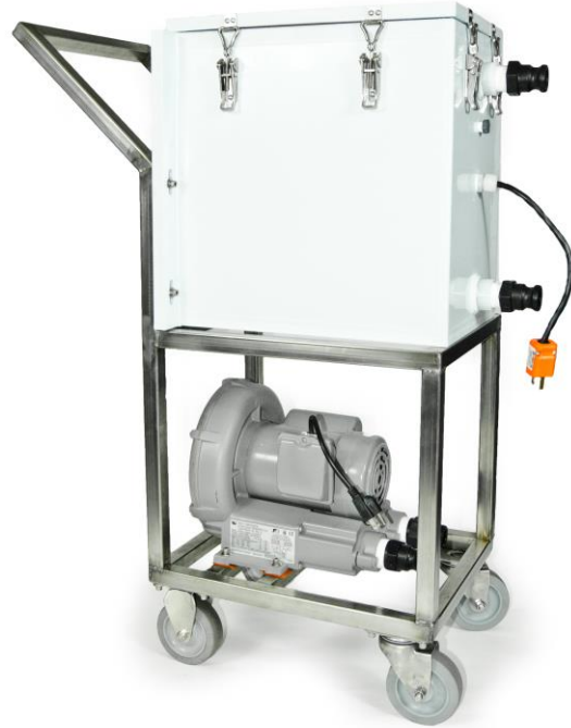
Dimensions: 17" L x 14" W x 35" H Weight: 80 lbs.

The ClorDiSys SCT combines both a Mix Box and Recirculation Blower to form a single, portable system to interface with any equipment that has minimal connection ports such as supply and exhaust HEPA Filter Housings and Biological Safety Cabinets (BSCs). The Mix Box, along with the included connection TEEs and 1-1/4"ID hoses supply the means by which to inject and sample chlorine dioxide gas and humidity into these closed systems and the regenerative blower provides a method of circulation through the system. All connections utilize standard 1" Banjo fittings. The SCT can be wired for both 120 and 220 VAC applications.